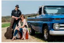
50 Miles to Empty