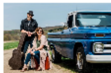
50 Miles to Empty