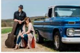
50 Miles to Empty